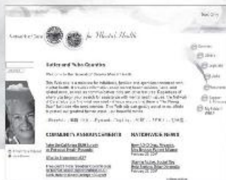
It's easy, even for beginners, to use Network of Care.

Network of Care is a comprehensive, Internet-based community resource for people with mental illness, as well as their caregivers and service providers. This easy-to-use Web site provides an extensive directory to put people in touch with the right services at the right time. It also offers vital information about diagnoses,