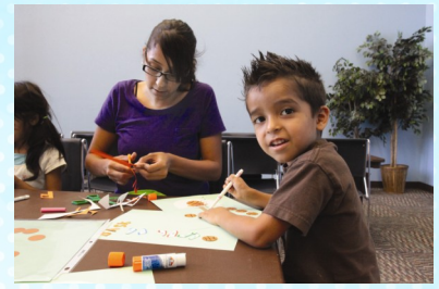
Child participant at the Yuba County Library