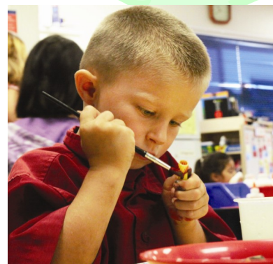
School Readiness participant at Cedar Lane School