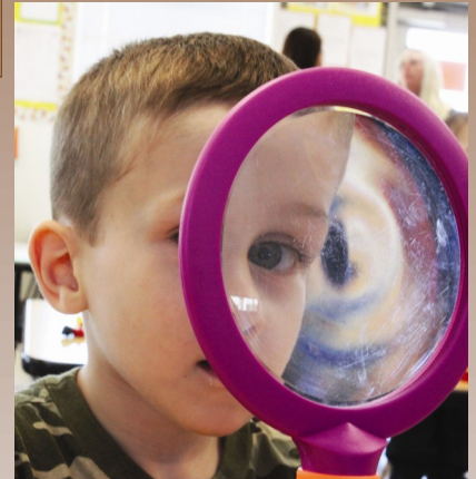
Child exploring during free play at E-Center Head Start